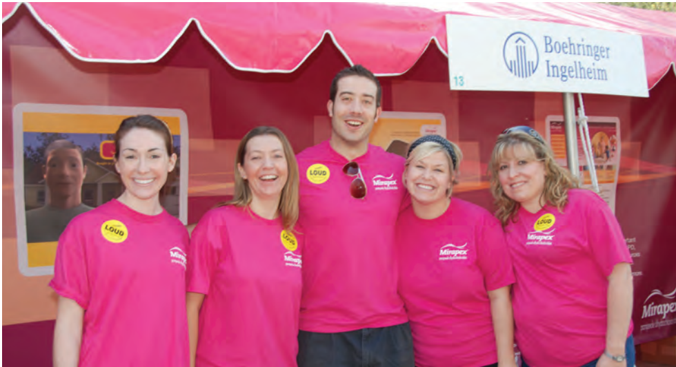
B.I. staff members in front of their pink booth

Contributing to the growing awareness of the Unity Walk is the passion of the Parkinson's community. In addition to the thousands who walked in Central Park, those unable to attend the event in-person were able to "virtually" walk alongside their community members. The Unity Walk teamed up with Boehringer Ingelheim Pharmaceuticals, Inc., our Proud Partner and Premier Sponsor, to create a Virtual Parkinson's Unity Walk. By signing up at the Unity Walk's website, www.unitywalk.org , people became involved in this important event even if they could not make it to NY. The website included an interactive map of the US that highlights the locations of "virtual walkers," showing the community's involvement.